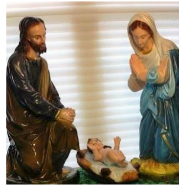
Figure 2. Digital photo in eBook submitted to NASA. Christmas scene of the Nativity – the baby Jesus is in a manger with Joseph and Mary beside Him. In the background is the symbol of a cross on which He saved humanity.

Example: an eBook about the Good News of the nativity, life, death, resurrection and love of Jesus Christ was sent into outer space on September 8, 2016. That happened to be the feast day of the birthday of the Blessed Mother Mary who gave birth and was a caregiver to Jesus on Earth over 2,000 years ago. As our caregiver, God blessed us on that special day of celebration to successfully send the Good News of Jesus beyond the Earth for future generations to read.