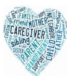
Figure 1. A Valentine Heart for Caregivers.

As adults, this cycle repeats itself and we joyfully become caregivers to our children or to other's children. As we grow older or become ill, spouses or family usually become caregivers to us – and in return we may become caregivers to them. Cooking a great meal is caregiving also.