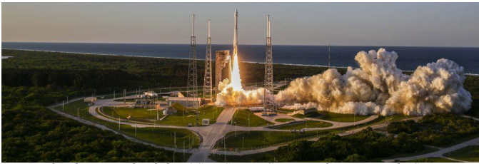
Figure 3. The Launch of the OSIRIS-REx Spacecraft at Kennedy Space Center, Cape Canaveral, Florida, USA, on Sept. 8, 2016.